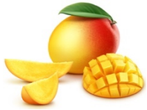
ਅੰਬ Amb (mango)