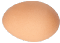
ਅੰਡਾ Aanda (egg)