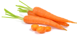
ਗਜਰ Gajar (Carrot)