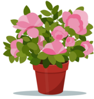
ਗਮਲਾ Gamalaa (Flower Pot)