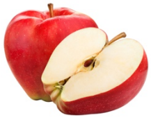
ਸੇਬ Seb (Apple)