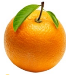
ਸੰਗਤਰਾ Sangatra (Orange)