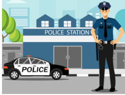
ਠਾਣਾ Thaanaa (Police Station)