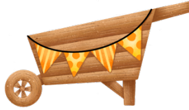
ਠੇਲਾ Thelhaa (Cart)