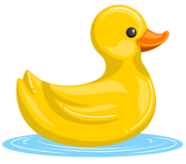
ਬੱਤਖ਼ Batakha (Duck)