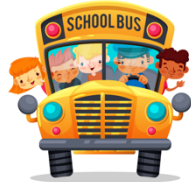
ਬਸ Basa (Bus)