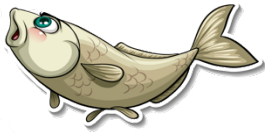
ਮੱਛੀ Machhee (Fish)