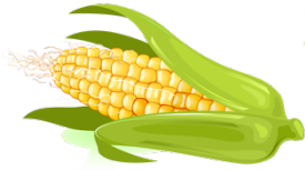
Makee ਮੱਕੀ (Corn)