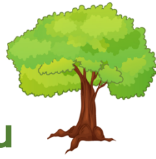
Ru Rukha (Tree)