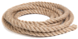
ਰੱਸੀ Rasee (Rope)